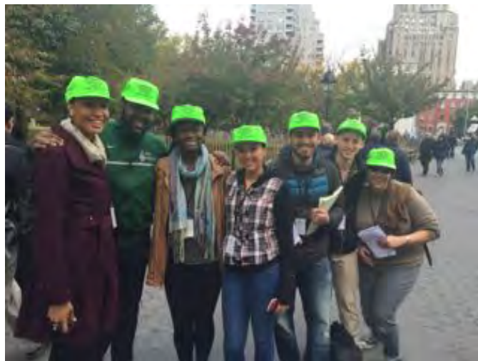
NLG-NYC and NCBL-NY Legal Observers at RiseUpOctober, Oct. 24, 2015.

and the NCBL LO team. Together we were able to effectively organize, build support, and work across organizations to implement the project.