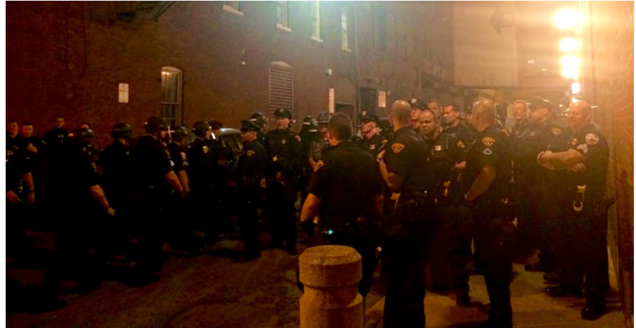
Cops block an alley to kettle protesters.

After the arrestees were released, the Ohio NLG and the BMLP met with Cleveland city officials to raise concerns about