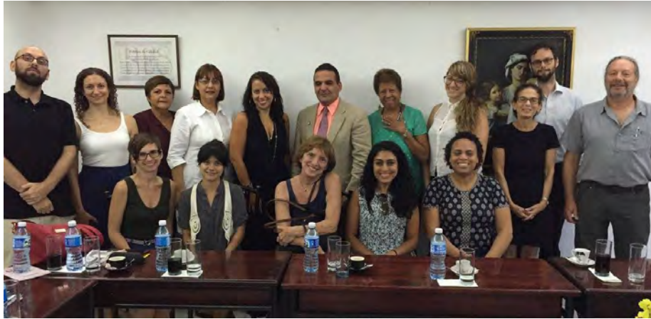
NLG Delegation members with ONBC leadership.

In a particularly moving meeting with the Organización