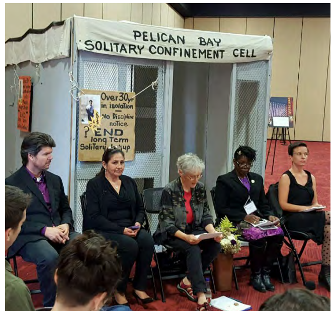
"Shutting the SHU" panel at the 2015 Law for the People Convention.

Members organized an inspiring panel at the Convention, "Shutting the SHU: Movement Strategies for Ending Solitary Confinement."