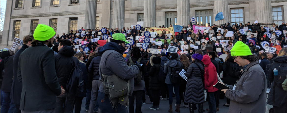
NLG legal observers at Brooklyn rally to demand ICE out of courts, December 2017.

T he National Lawyers Guild has a rich and long history of being a central part of efforts for social justice. While we are very proud of this history, we want you to join the Guild because of its exciting future. Join the Guild because it continues to play a crucial role in social justice struggles. Join the Guild because we need your passion and creativity if we are to continue to adapt in this ever-changing political climate.