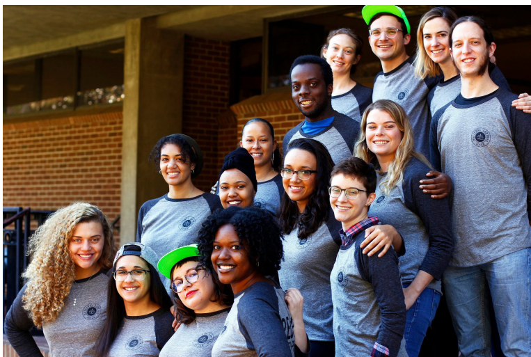
University of North Carolina NLG students in 2019

The national student email list, as well as the strong personal connections made at regional and national meetings allow the chapters to coordinate as a national network. NLG students also coordinate for national actions: every year in March, student chapters from across the country hold simultaneous events that call for the abolition of the prison-industrial complex in our national Student Week Against Mass Incarceration. Student chapters hold press conferences, have speakers and speak-outs, and educate their fellow classmates by tabling or fliering the school. Other student-led projects include the NLG Radical Law Student Project and days of action against rising student debt. In addition