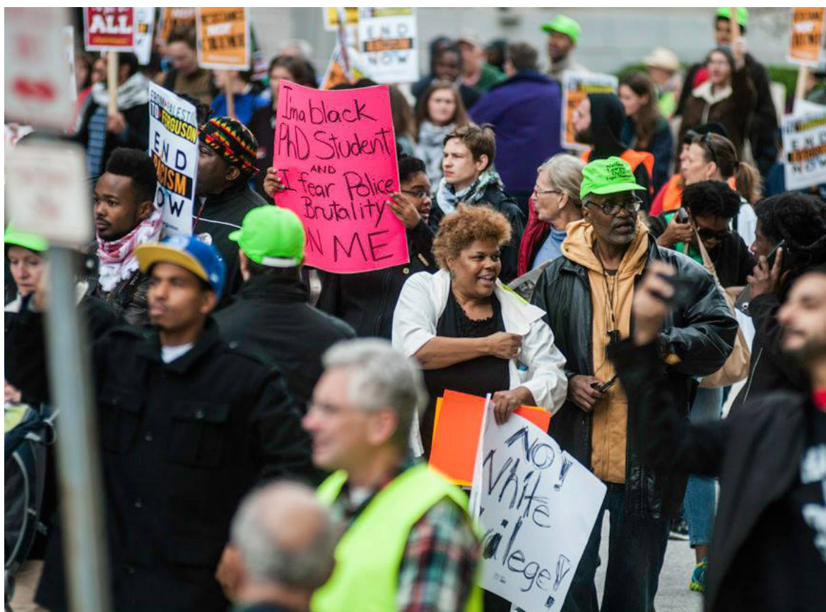
NLG Legal Observers attend an action in Ferguson, MO in 2014