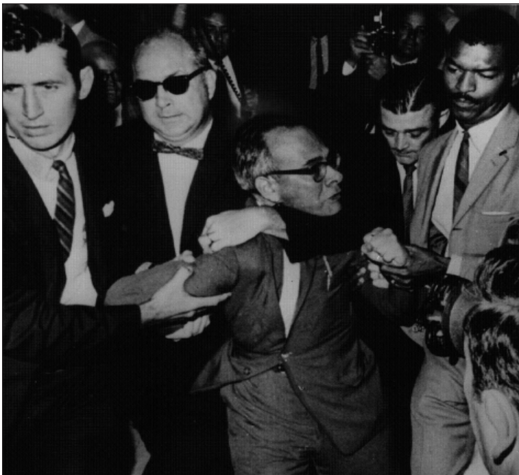
Arthur Kinoy being dragged from the hearing room of the House UnAmerican Activities Committee (HUAC) in 1966.

Throughout the 1960s and 1970, the NLG members continued to provide legal support to emerging social movements. Guild members represented Vietnam War draft resisters, antiwar activists, the Chicago 7 after the 1968 Chicago Democratic Convention, and GIs who opposed the war. Guild members also defended FBI-targeted members of the Black Panther Party, the American Indian Movement, and the Puerto