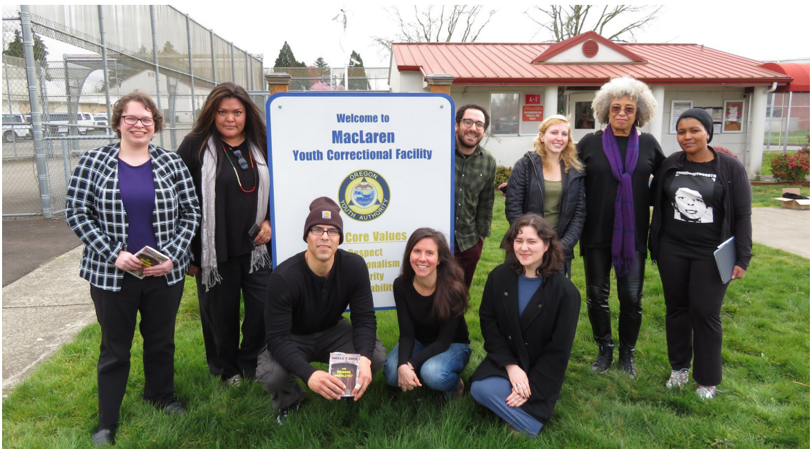
Dr. Angela Davis joined the Lewis and Clark NLG's abolition group at MacLaren Youth Correctional Facility to talk about prison abolition, collective organizing, and critical resistance. The group meets every other week with youth who are incarcerated to have discussions, bring in guest speakers, and work on projects.