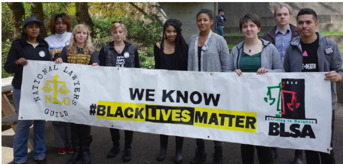
■ Lewis and Clark NLG and BLSA on the 2016 NLG Day of Action to Support the Movement for Black Lives.