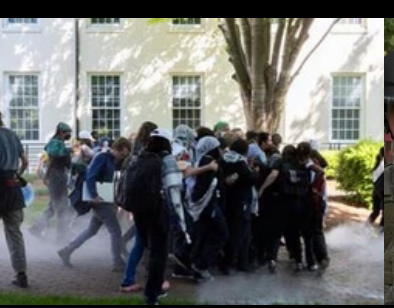
Emory University, Atlanta, GA

Just like in 1968, universities are responding to peaceful student anti-war activism by condemning it, calling in law enforcement and even the National Guard, and having students arrested, suspended and evicted rather than responding to demands to end university complicity in genocide and oppression.