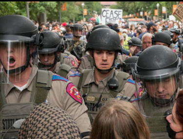
University of Texas, Austin, TX